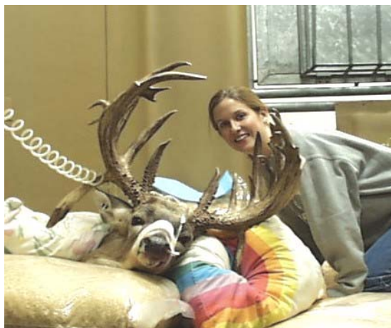
Photo submitted by Rod O'Clair-Jamestown. It is courtesy of Texas A & M Vet School. A hunter found buck with antlers in barbed wire & barely alive. Thanks Rod!!