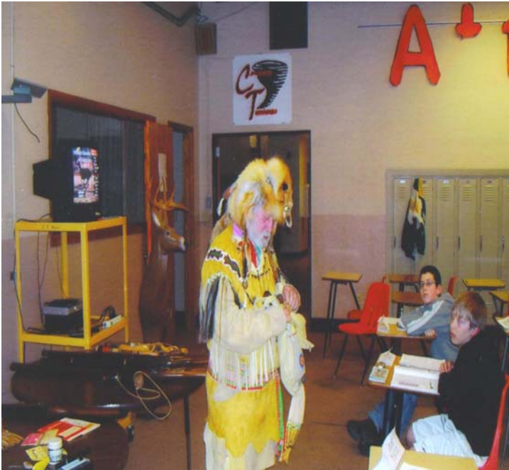
Mountain Man explaining the life of a mountain man & how important muzzle loader & other survival equipment was, stressing safety. (Cavalier class-2008)