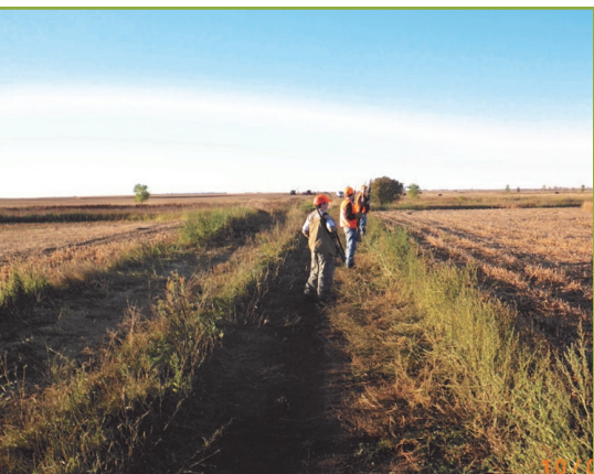
Youth pheasant mentored hunt near Marion, N.D.