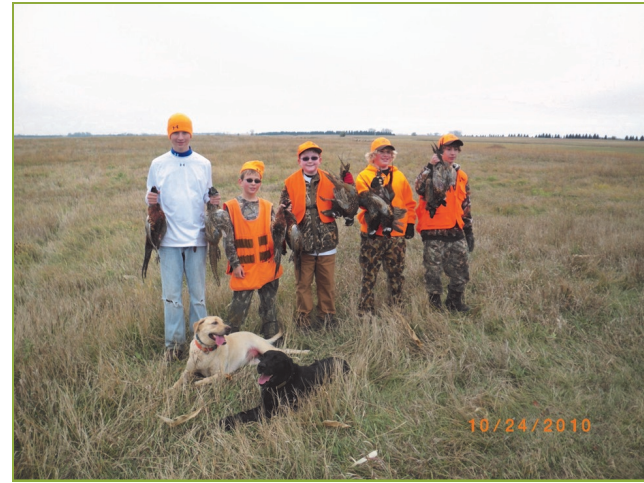
The hunters and volunteers that make the Stutsman County Wildlife Club Pheasant Shoot possible