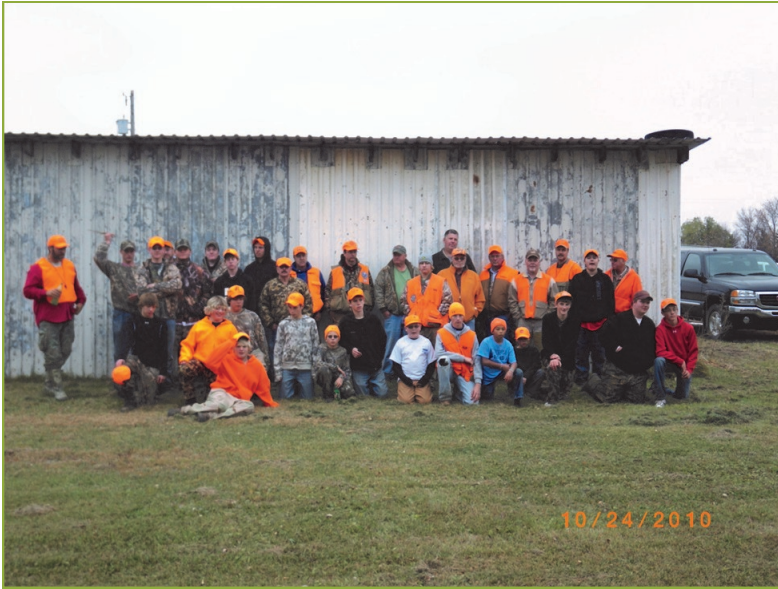
One happy group of hunters at the Stutsman County Wildlife Club Pheasant Shoot

We need to have shooting clinics in our district. If your event is pre-approved by NDHEA, they can cover the costs of food, beverage, ammunition, advertising and mileage for any instructor travel. If you are interested in putting on an event like this, contact me and I'll help you through the process. It can be a great way to incorporate live fire for your students or introduce someone new to the shooting sports and possibly hunting.