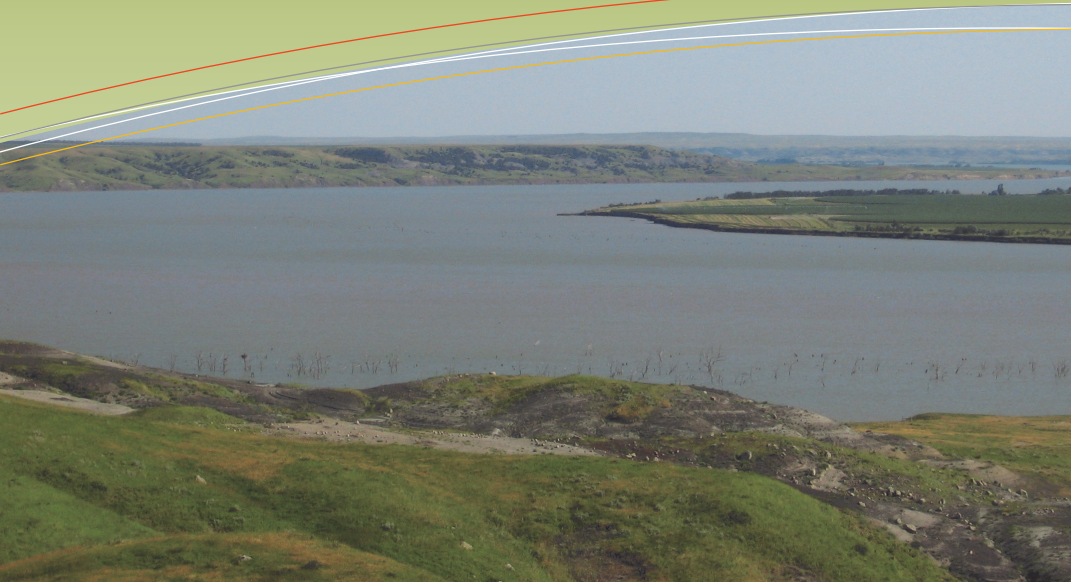
Photo of Missouri River